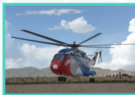
AC313- 13 ton civil