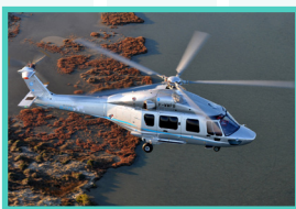
AC352- 7 ton civil