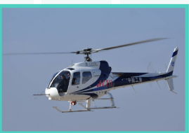
AC311- 2 ton civil

2010 2011 2012 2013 2014 2015 2016 2017 2018 2019 2020 2021 2022 2023