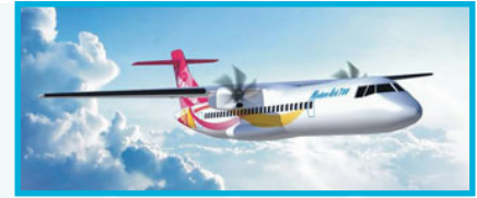
Establish a brand-new turboprop aircraft series based on Modern Ark 700

Promote Modern Ark 700 as a key product in marketing management